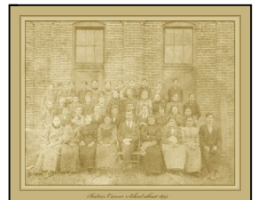
c. 1899, Bakers Corner School, abt 1899