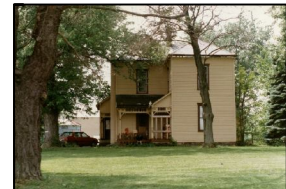
George Foulke Farm House