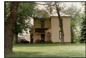
George Foulke Farm House