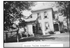
1930, 1930 - George Foulke Farm House,

This will be one of the largest sales that has been held in that neighborhood in a long time.