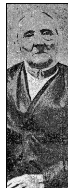
Spouse: Lydia Kellum