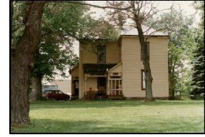
George Foulke Farm House