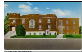
Industry UB Church