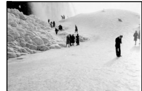
c. 1943, Niagara Falls