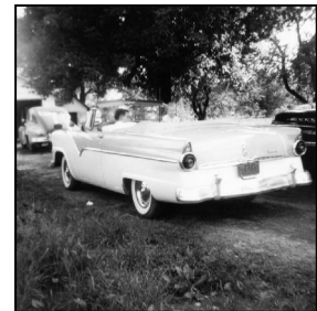
c. 1962, 1949 Pontiac at left