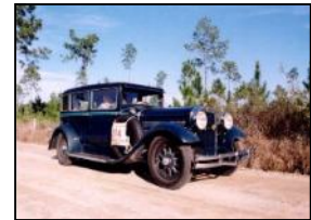
Essex like the one August & Mabel had