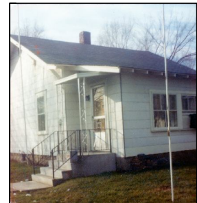
c. 1978, 17th St. House, NE Corner