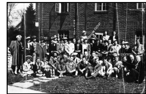
1942, Photo Index