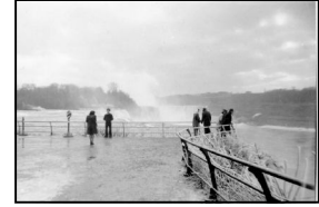
c. 1943, Niagara Falls