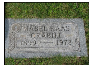
2010, Headstone for Mabel