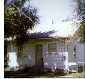
c. 1977, Back Door, 17th St. House