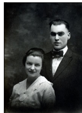
1917, Wedding Photo