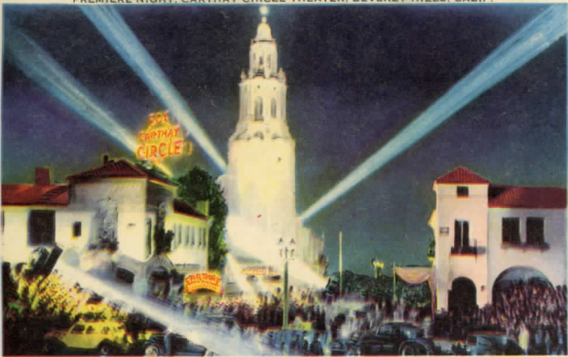
PREMIERE NIGHT, CARTHAY CIRCLE THEATER, BEVERLY HILLS, CALIF.