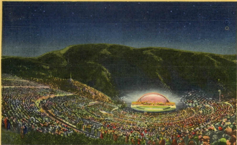
THE SYMPHONY UNDER THE STARS