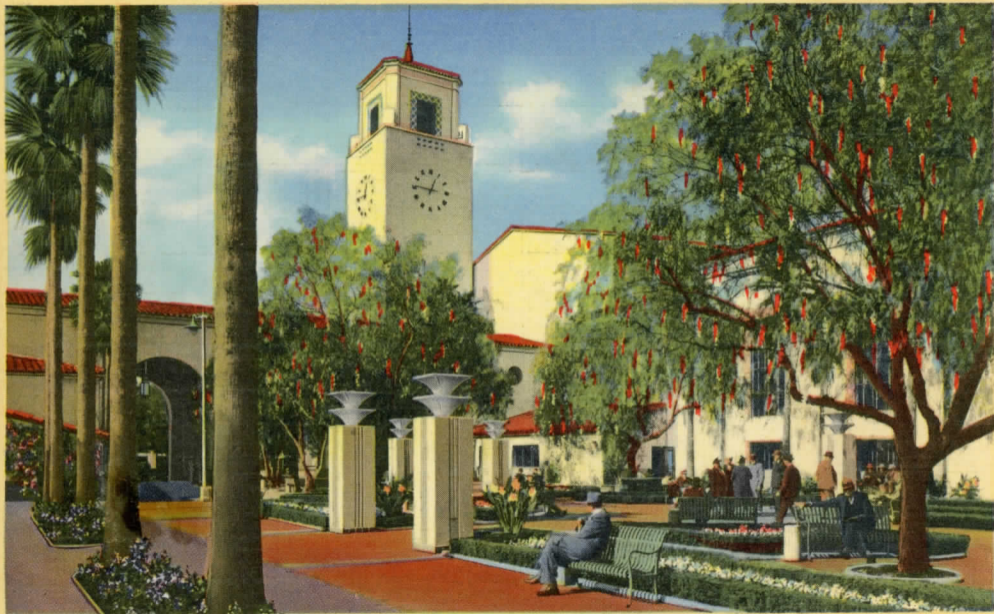
LA-31—South Patio, Union Depot, Los Angeles, California