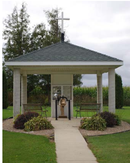
Sacred Heart Shrine

located adjacent to the cemetery. Today there is a memorial shrine, seen below, which marks the place where the church stood for so many years.