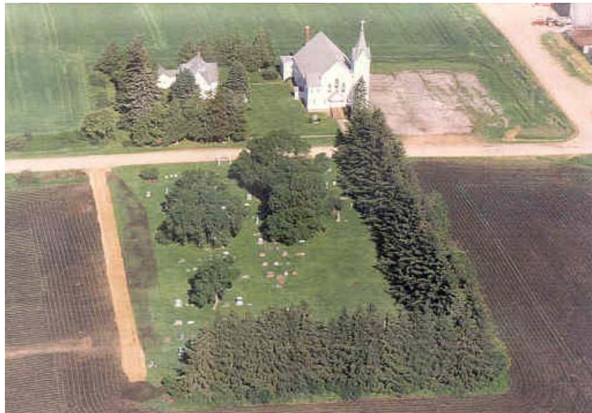
Aerial View of the church and cemetery (before the fire of Mar 2000 completely destroyed the church building)

The name of St Ignatius was changed to Sacred Heart at the dedication of the new church in 1912.