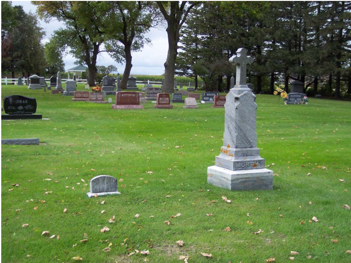
Sacred Heart Cemetery, near the middle