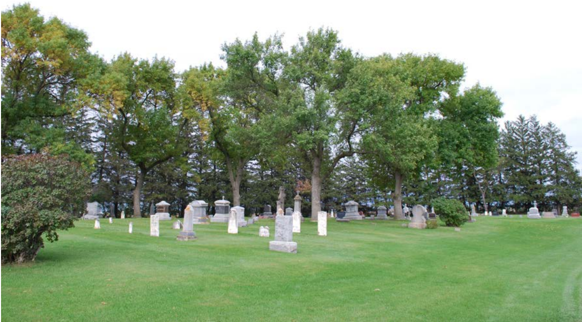
Sacred Heart Cemetery looking from the southwest corner